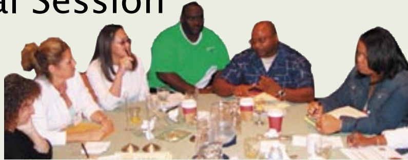
Popular break-out sessions were held on the final day of the retreat. Above, a session of clinical programs and, below, information technology.

Held for the second year in a row in Marco Island, the session began with a welcome and awards reception on Friday night. Saturday and Sunday featured an array of presentations including HCN's new corporate structure, the new provider service network, Prestige Health Choice, Atlantic Care Network, Infinet Data Solutions and the formation of a Foundation to lead fund raising efforts.