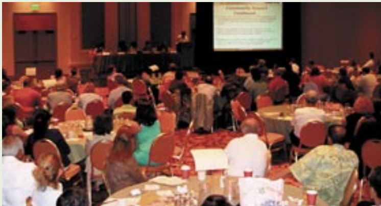
The ballroom was filled during the presentations.